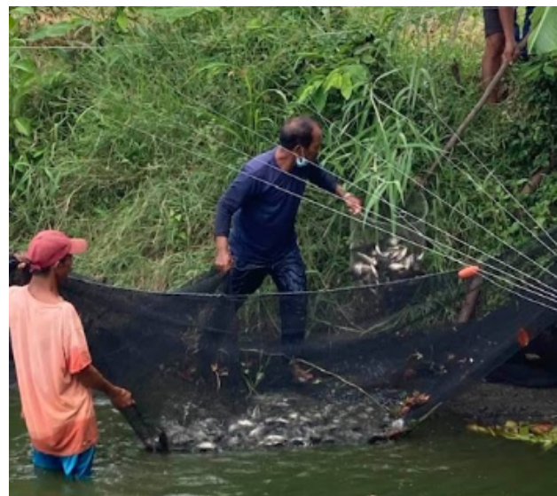
Harvesting of the tilapia in BatStateU ARASOF-Nasugbu facility