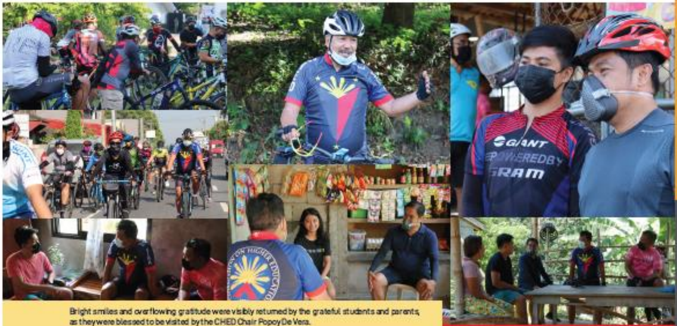
Bright smiles and overflowing gratitude were visibly returned by the grateful students and parents, as they were blessed to be visited by the CHED Chair Popoy De Vera.