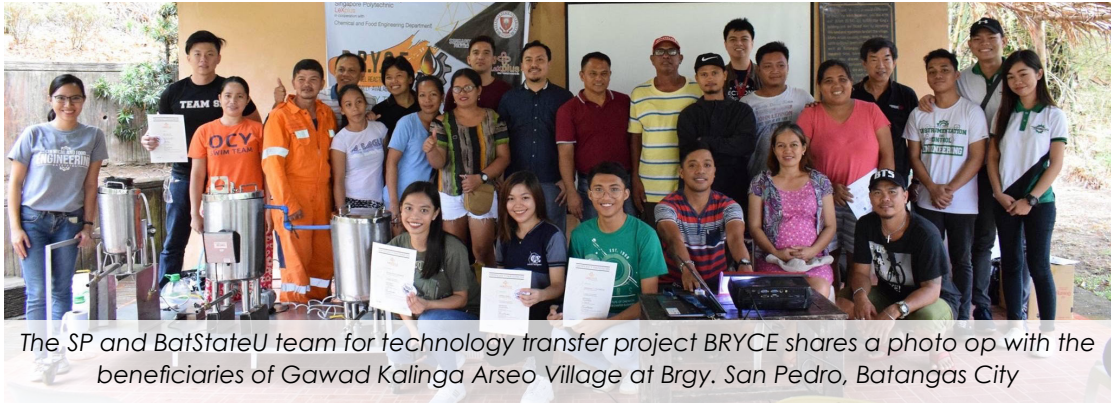
The SP and BatStateU team for technology transfer project BRYCE shares a photo op with the beneficiaries of Gawad Kalinga Arseo Village at Brgy. San Pedro, Batangas City

The Singapore Polytechnic (SP) and Batangas State University collaborated on April 8-11 to develop the Biodiesel Reactor Yielding Commercially Available Energy (BRYCE) for a technology transfer collaboration project.