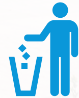
Water sensitive waste disposal