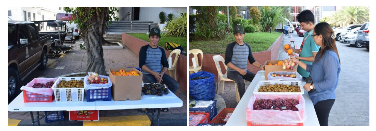
Figure 3. Ka-Fred's Fruit Stand

The figures shown below are the menus currently in use by the university canteen tenants of the RGO Pablo Borbon.