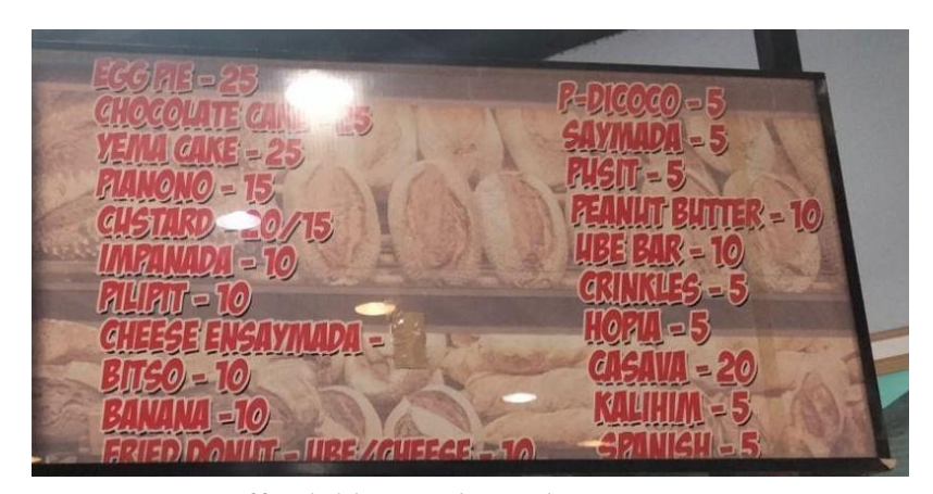
Figure 5. Affordable Snacks in the University Canteen