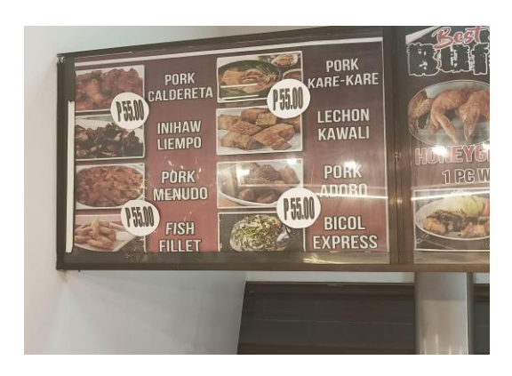
Figure 1. Sample menu of the foods served at the university canteen.

The Resource Generation Office has published an advisory in relation to the canteen operation, stating that the university canteen offers items that the constituents can access that are both healthy and reasonably priced. They made sure that every food that is served is freshly cooked and safe for the staff and students to consume without spending a lot. An advisory has been published in many university bulletins to make sure that everyone is aware and informed.