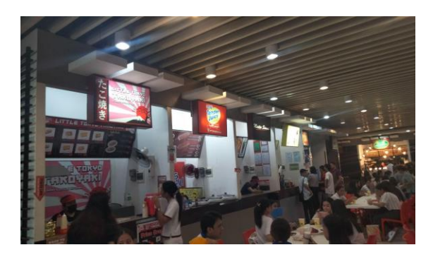
Figure 2. Stalls inside the university canteen.