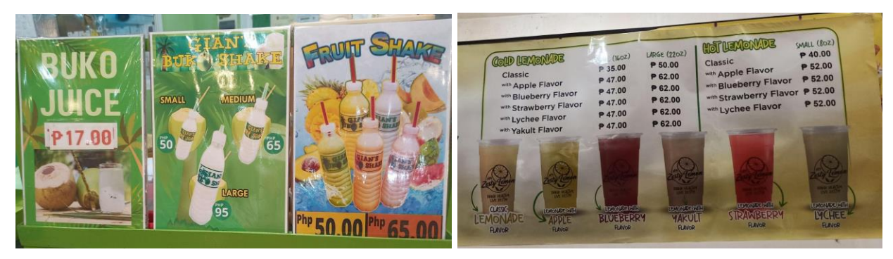
Figure 4. Affordable Beverages in the University Canteen