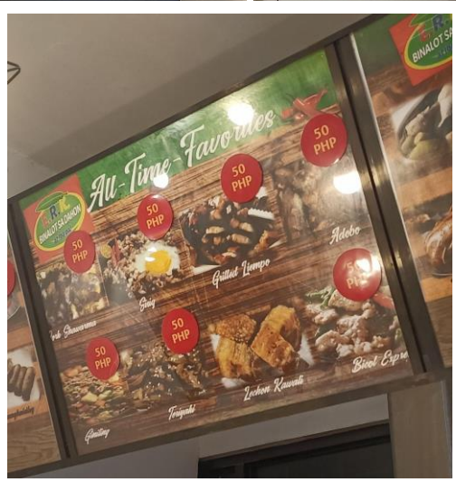
Figure 6. Healthy and Affordable Full Meals in the University Canteen