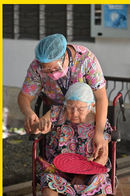
Prevalence of CED among the elderly significantly declined from 17.2% in 2015 to 14.3% in 2018-2019. Meanwhile, both overweight and obesity significantly increased to 23.7% and 6.1%, respectively in 2018-2019 (Figure A.35).