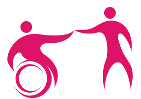
Students with Disability