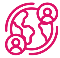
International Students from Developing countries