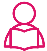
Students starting a Degree