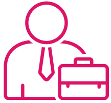
Employees with disability