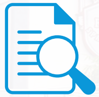
Marine ecosystem assessment

The center aims at providing research, teaching, and extension services of the Batangas State University on the marine resources and its marine environment in the Verde Island Passage.