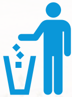
Water sensitive waste disposal