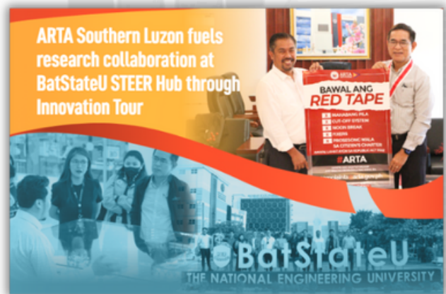
Policy-focused research in collaboration with government departments