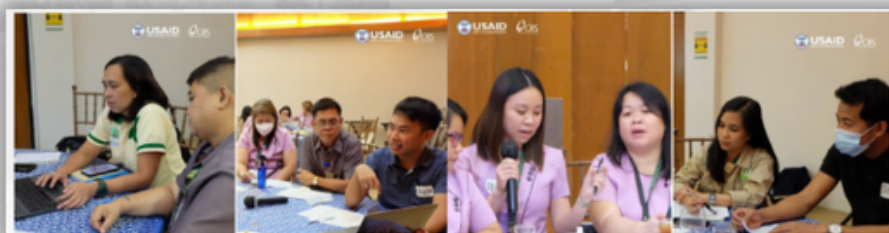
BatStateU provide specific service to government

Leading Innovations, Transforming Lives Building the Nation