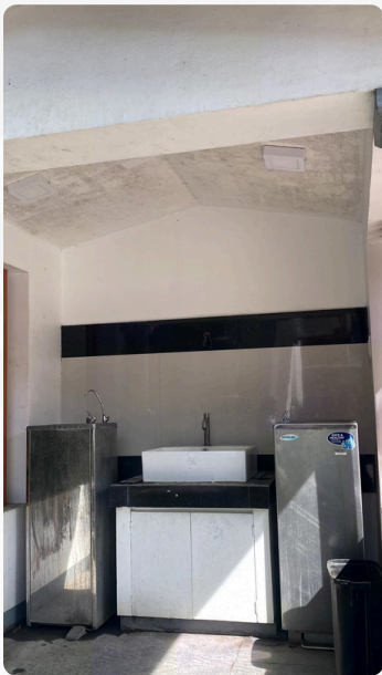
Water fountain in between CTE building & Command Center