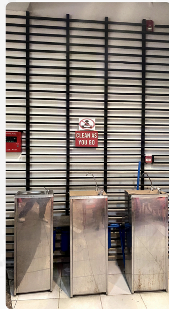
Water fountains inside cafeteria