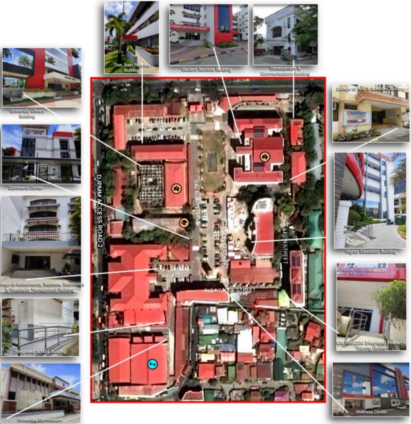
BATANGAS STATE UNIVERSITY Map identifying wheelchair ramps, disabled toilets and parking access