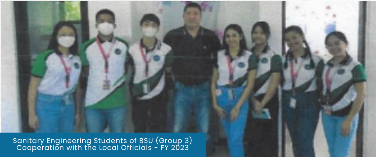
Sanitary Engineering Students of BSU (Group 3) Cooperation with the Local Officials - FY 2023

The implementation of Sustainable Development 6 (SDG 6) in Purok 9, Barangay Coliat, Ibaan, Batangas, was focused on ensuring access to clean water and sanitation, fostering a healthier and more resilient community. This initiative addressed various environmental and social issues such as contamination of water sources in their inland rivers; Duhatan and Talunan River, insufficient waste disposal practices; livestock and domestic waste, and the lack of access to clean water for the minority. The Information, Education, Communication (IEC) Campaign conducted by the group in Barangay Coliat, Purok 9, with the cooperation and vocal support from the local officials in the community, assessed the implications and impact of these issues on the communities health and socio economic factors. The campaign's systematic approach has led to heightened awareness and tangible actions towards sustainability. To ensure continued progress in clean water and sanitation initiatives in Barangay Coliat, Purok 9, ongoing community efforts are essential to maintain community engagement and increase awareness of environmental conditions, thereby fostering a positive impact and resilient community.